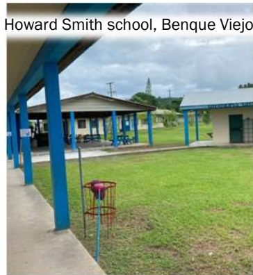
Howard Smith school, Benque Viejo