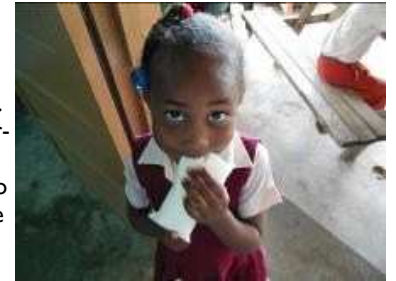
Milk with breakfast before school in San Ignacio, Cayo District, Belize.

During incorporation, I was pretty frustrated with all the government paperwork here; then, the right thing to do in Central America was establish another company there. Yes, we have a "Branch-office" (separate corporation) in San Ignacio,