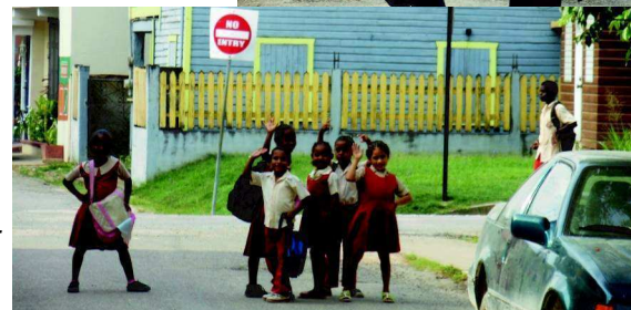
(Right) Off to school with a healthy breakfast and the new "Adventure Bibles" provided by your support.....